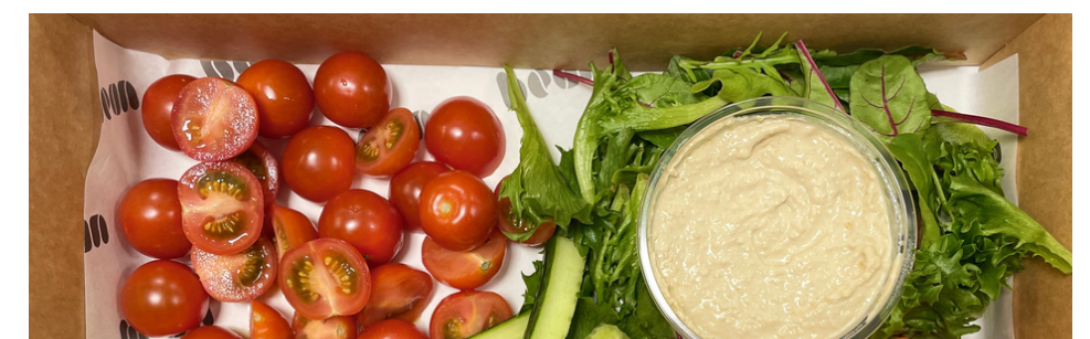
CLASSIC FISH BOX £24.00